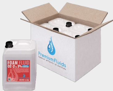
Boxes 6x2,5L – 4x5L