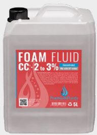
Drums 2,5L – 5L – 10L – 20L 200L -1000L