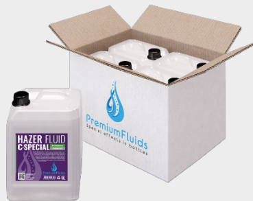
Boxes 6x2,5L – 4x5L