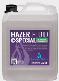
Drums 2,5L – 5L – 10L – 20L 200L -1000L