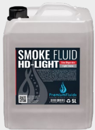
Drums 2,5L – 5L – 10L – 20L 200L -1000L