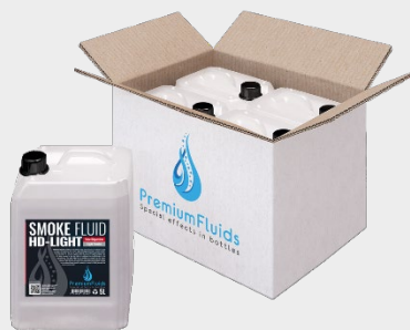
Boxes 6x2,5L – 4x5L