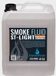
Drums 2,5L – 5L – 10L – 20L 200L -1000L