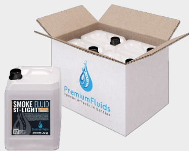
Boxes 6x2,5L – 4x5L