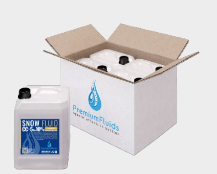
Boxes 6x2,5L – 4x5L