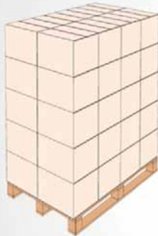
BOX PALLET 4 OR 5 LEVELS

Pallets also available in 60x80cm - 75x115cm - 100x120cm